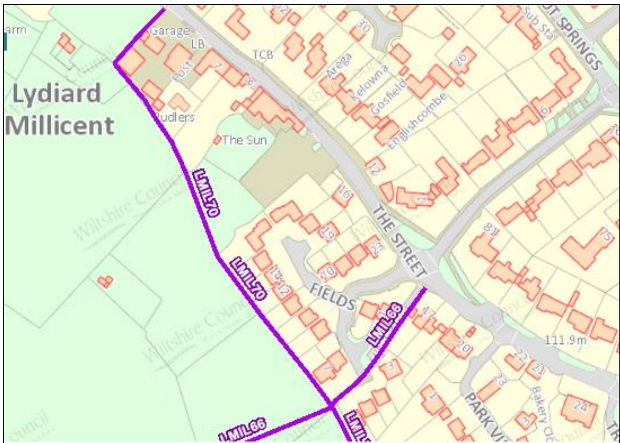
Illustration 2: Wiltshire Council Public Rights of Way map for footpath LMIL70