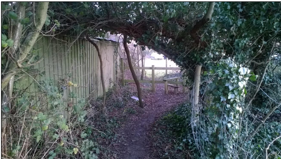
Illustrations 9a and 9b: Overhead tree growth to be cut out. Shown looking from each direction. The tree is at head height of about 69" (1.75m) at the centre of the path