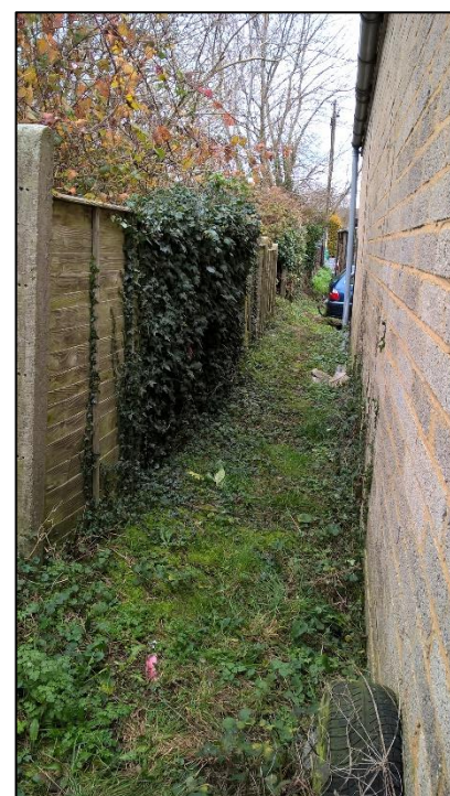
Illustrations 10, 11 and 12

provided by WC Senior Rights of Way Warden after site meeting with Parish Clerk on 5 th December 2017 showing the debris to be cleared by adjacent tenants