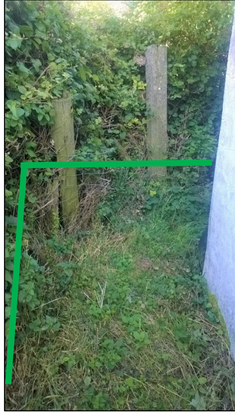
Illustration 4: Cut back corner to original concrete posts to provide more space for walkers as indicated by green lines