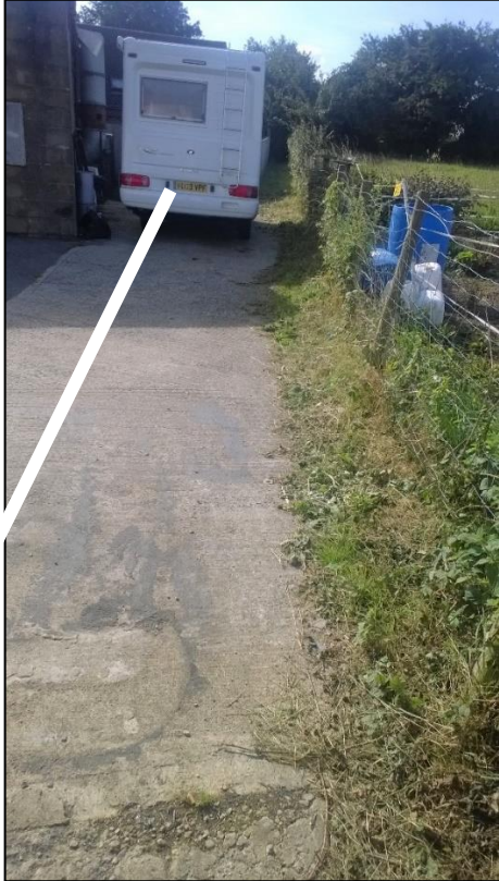
Illustration 3: White line to help maintain the right of way limits. Path width determined by timber fence behind the white caravan.