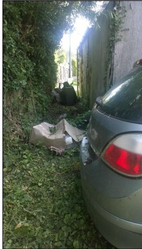
Illustrations 6 and 7: Obstructions to be moved (some already gone as at January 18)