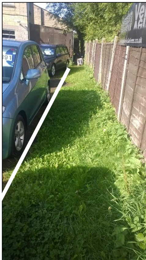
Illustration 8: White line to help car sales tenant see and maintain the right of way limits or boundary marked by larch edging as recommended by WC Senior Rights of Way Warden