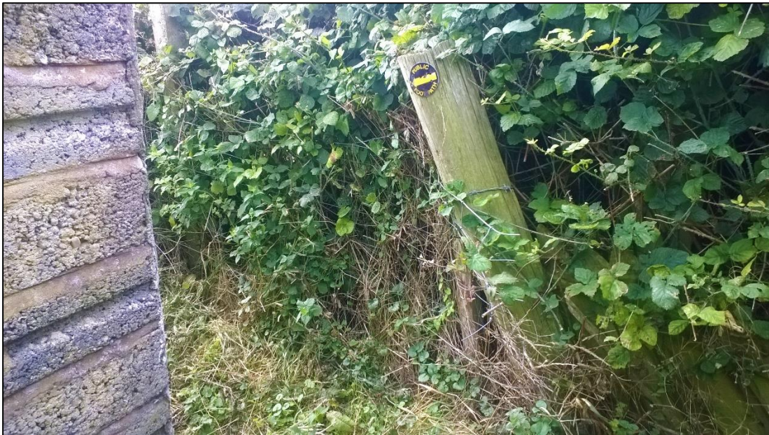
Illustration 5: Remove rotten corner post and other timber posts and re-use existing concrete posts.